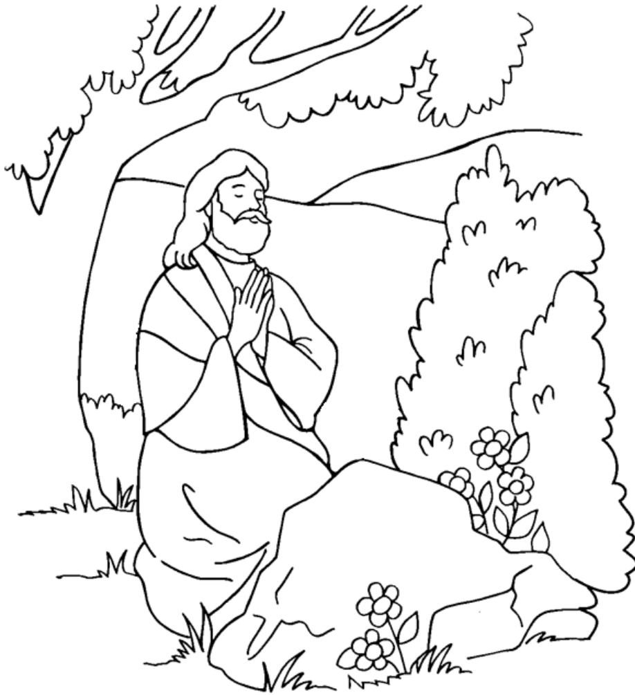
Jesus Prays for His Disciples